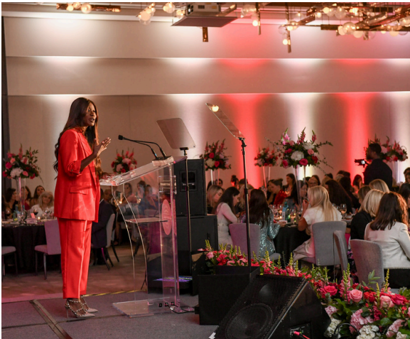
Dame Helen Mirren